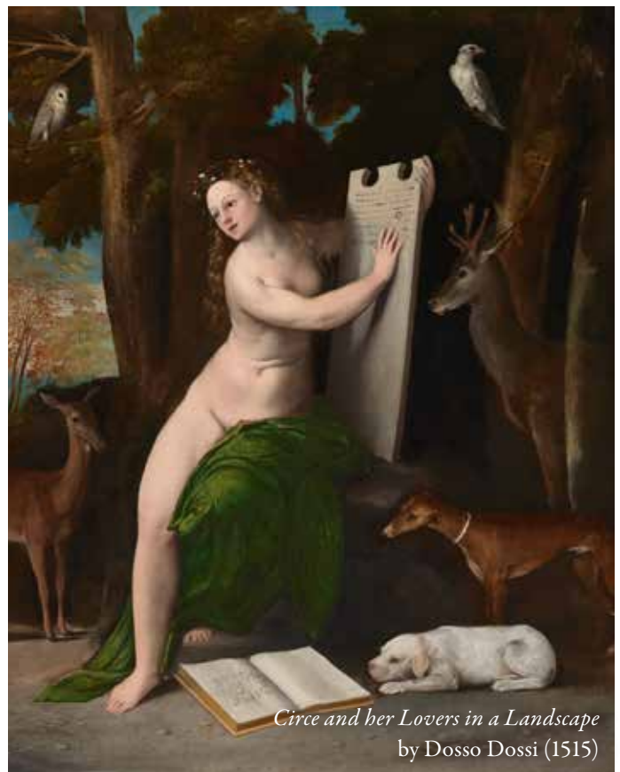
Circe and her Lovers in a Landscape by Dosso Dossi (1515)