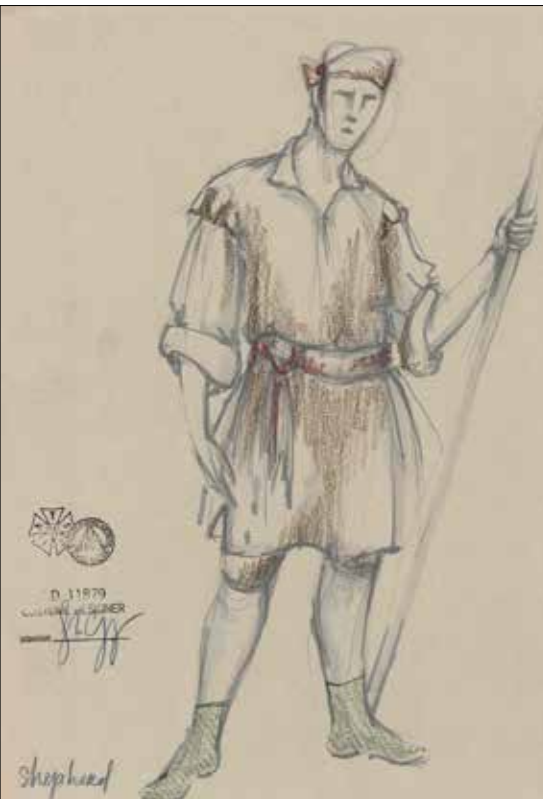
Costume rendering of the shepherd