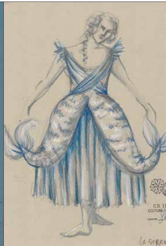
Costume rendering of the siren