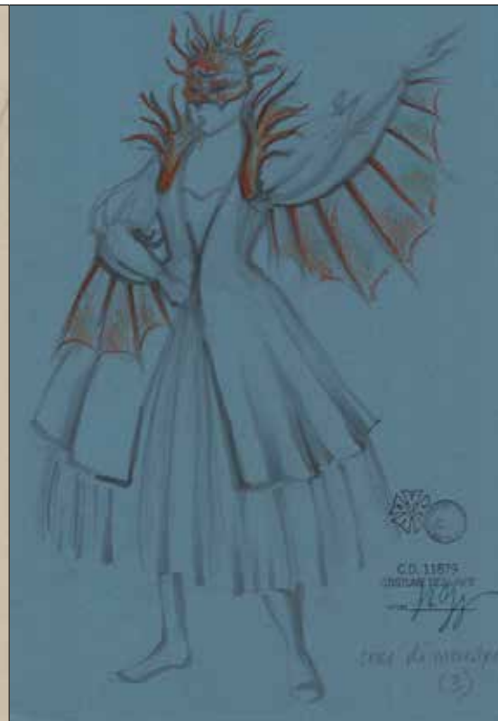
Costume rendering of the "coro di monstri"