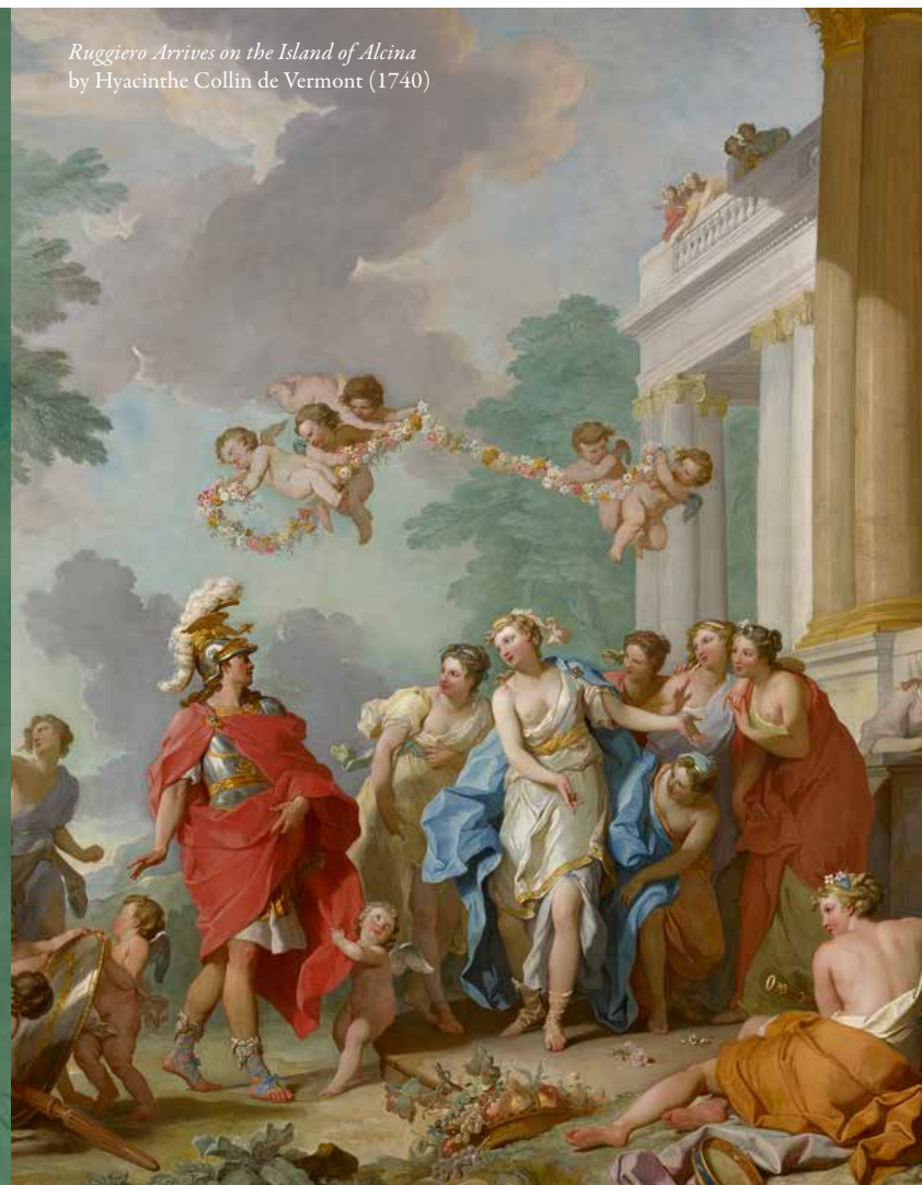
Ruggiero Arrives on the Island of Alcina by Hyacinthe Collin de Vermont (1740)

New York Baroque Dance Company, she has performed at Drottningholm Theater in Sweden, the International Händelfestspiele Göttingen, Danspace at St. Mark's Theater, the Guggenheim Museum, and the Potsdam Sanssouci Music Festival. From 2006-2012, she lived in Cologne, Germany, and toured Europe as a freelance dancer, performing in Italy, Germany, Belgium, Switzerland, and France. She has taught master classes in baroque dance at numerous universities in the United States and in Germany, and has given several lectures at symposia for eighteenth-century performance. She has been an adjunct professor at DePaul University, Wheaton College, and Northwestern University. She holds a BFA summa cum laude in dance performance from The Ohio State University, and an MA in Tanzwissenschaft from the Hochschule für Musik und Tanz Köln.