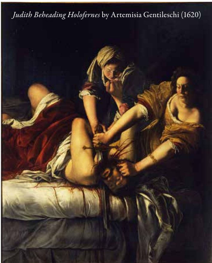
Judith Beheading Holofernes by Artemisia Gentileschi (1620)