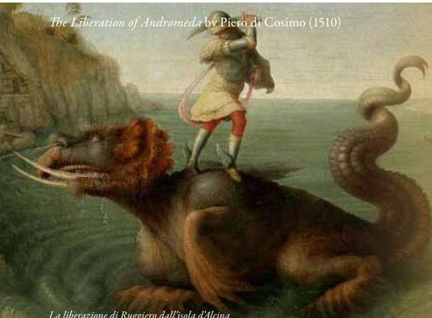
La liberazione di Ruggiero dall'isola d'Alcina

Haymarket Opera Company enriches the musical community of Chicago and the Midwest with performances of 17th- and 18th-century operas and oratorios using period performance practices.