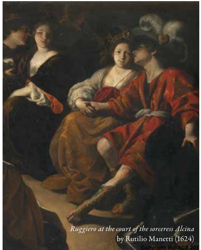
Ruggiero at the court of the sorceress Alcina by Rutilio Manetti (1624)

Upon seeing Ruggiero freed from Alcina's spell, human inhabitants of the island, whom Alcina has turned to plants, come out of the shadows and beg to be liberated from Alcina's island. Melissa promises to free them. As Ruggiero exits to prepare for his flight from Alcina's island, Alcina returns to look for him.